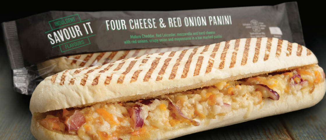
FOUR CHEESE & RED ONION PANINI Cheesy mature Cheddar, Regato, Red Leicester and mozzarella with red onions, crispy onions and mayonnaise.