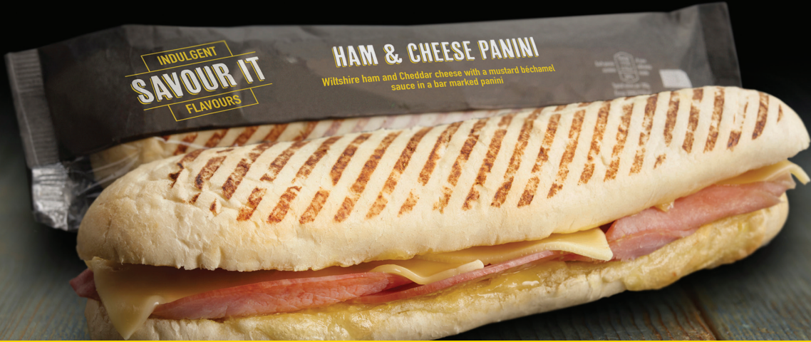
HAM AND CHEESE PANINI Tasty Wiltshire ham and Cheddar cheese with a mustard bechamel sauce.