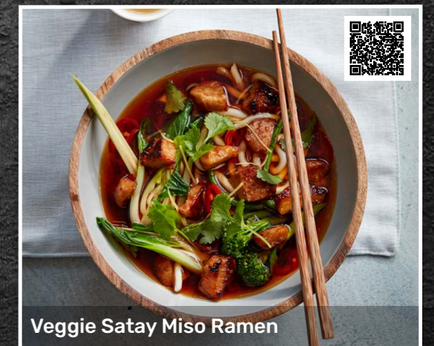
Veggie Satay Miso Ramen