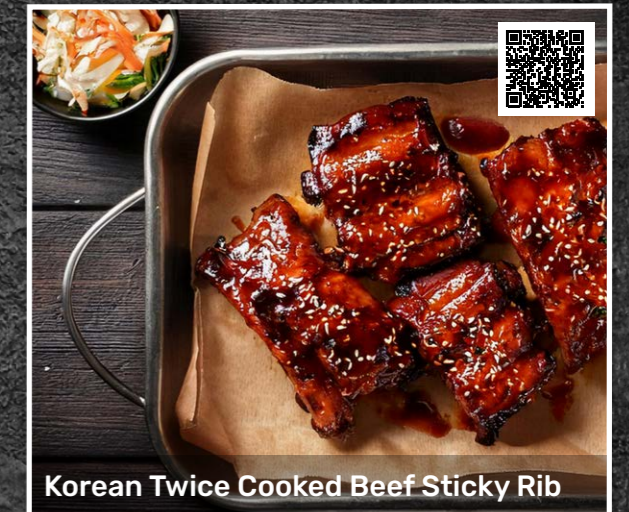
Korean Twice Cooked Beef Sticky Rib