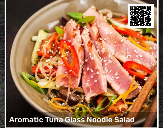
Aromatic Tuna Glass Noodle Salad