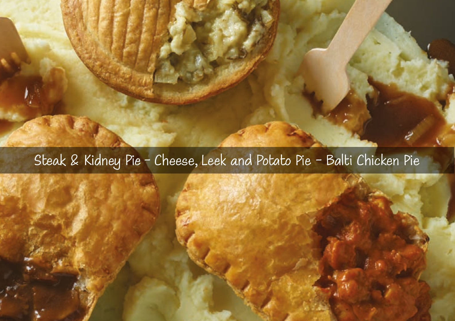
Steak & Kidney Pie - Cheese, Leek and Potato Pie - Balti Chicken Pie