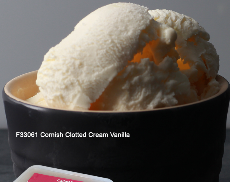
F33061 Cornish Clotted Cream Vanilla