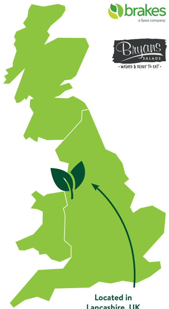
Located in Lancashire, UK