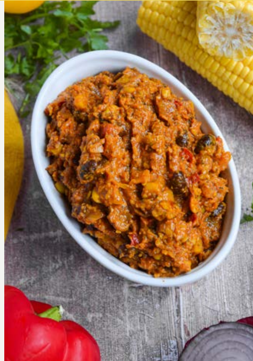
Chipotle & Corn Veggie Barbacoa