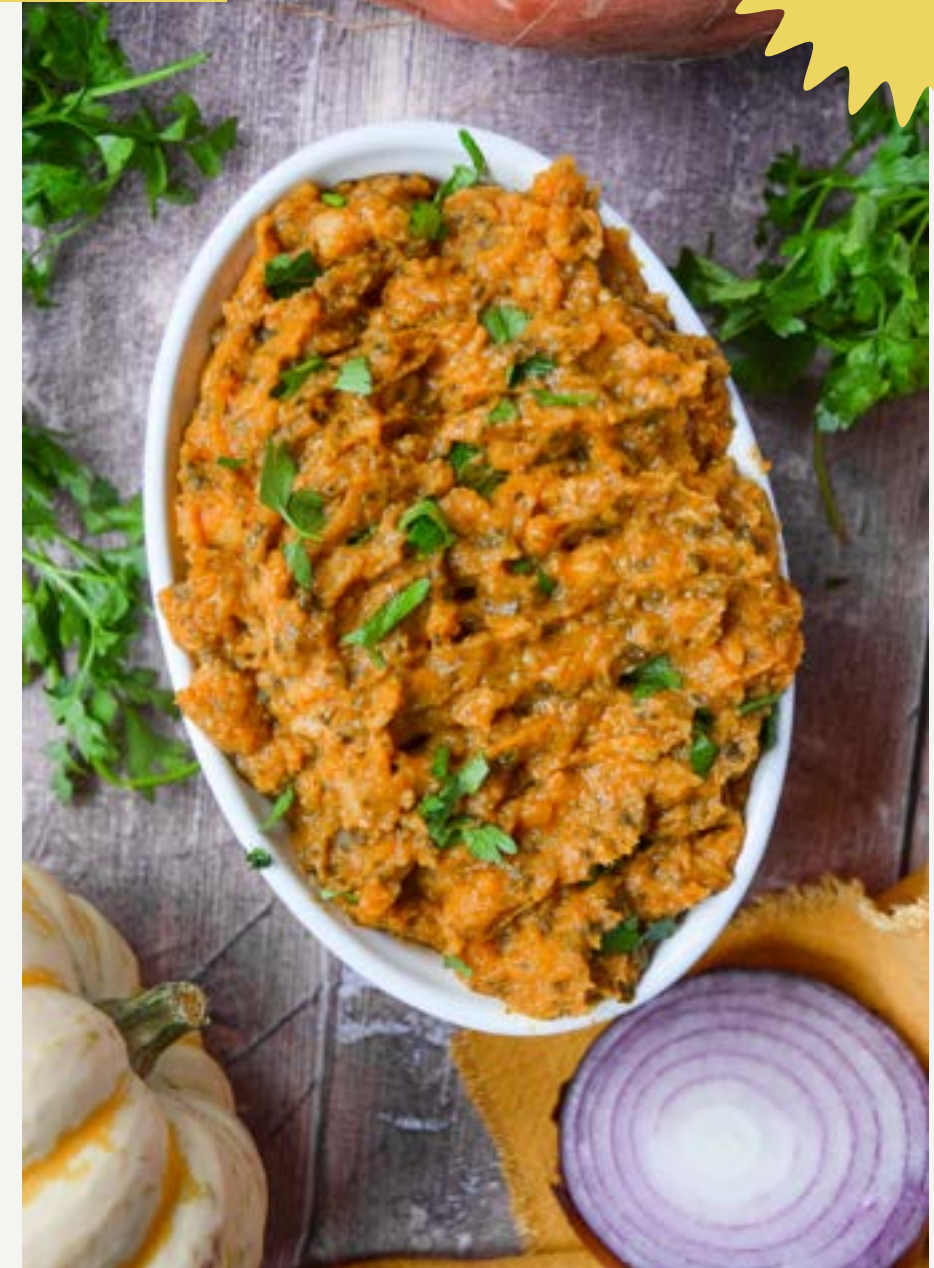
Sweet Potato & Butternut Dhansak