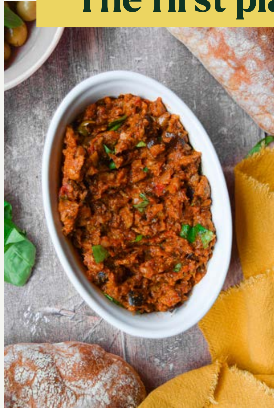
Roasted Sicilian Pesto Caponata