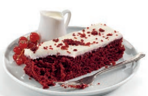
SYSCO ESSENTIALS HIGH FIBRE RED VELVET TRAYCAKE F 152732 | 2X1