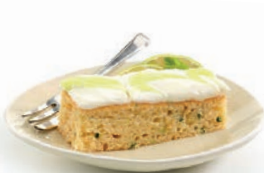
SYSCO ESSENTIALS HIGH FIBRE COURGETTE AND LIME TRAYCAKE F 152731 | 2X1