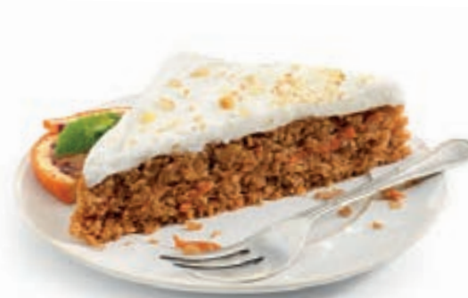
SYSCO ESSENTIALS HIGH FIBRE GLUTEN FREE CARROT TRAYCAKE F 152733 | 2X1