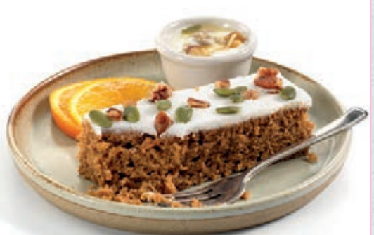
SYSCO ESSENTIALS HIGH FIBRE GLUTEN FREE PUMPKIN TRAYCAKE F 152734 | 2X1