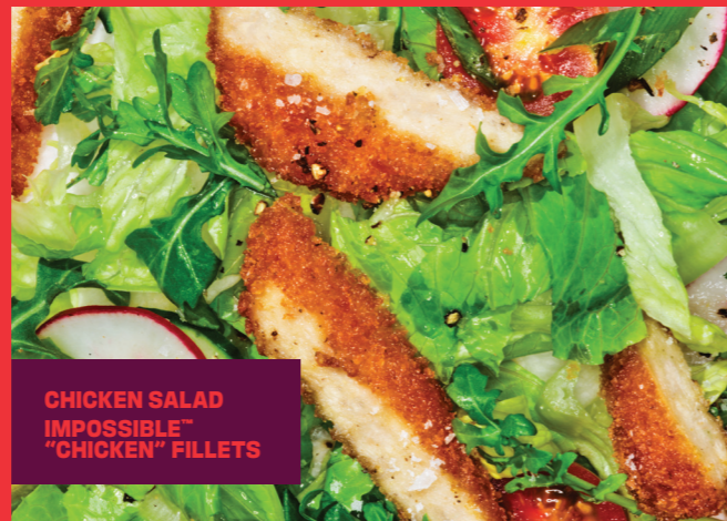
CHICKEN SALAD IMPOSSIBLE™ "CHICKEN" FILLETS