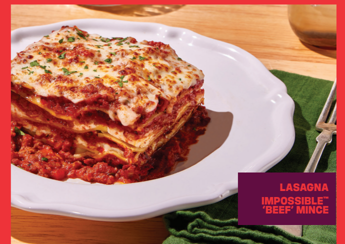
LASAGNA IMPOSSIBLE™ 'BEEF' MINCE