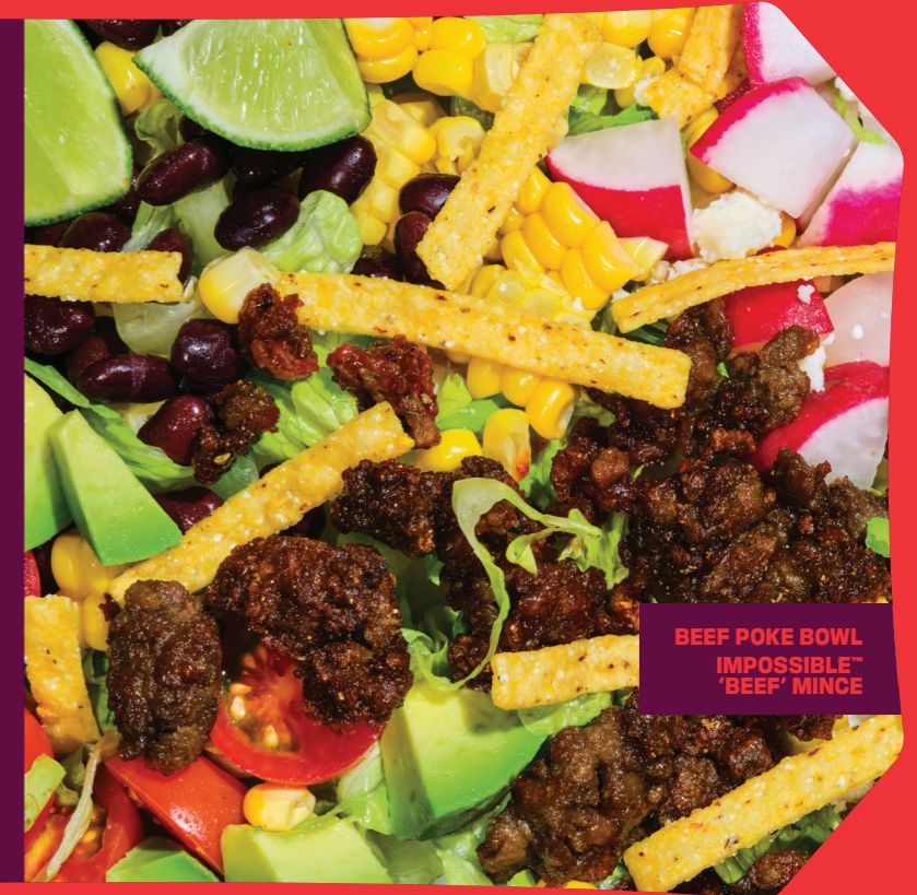
BEEF POKE BOWL IMPOSSIBLE™ 'BEEF' MINCE

Better-for-you bowls are gaining momentum, with their versatile, nutrient-dense combinations of grains, proteins and fresh vegetables appealing to health-conscious consumers. Their balance and customisation make them a standout choice across multiple dayparts.