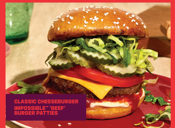
CLASSIC CHEESEBURGER IMPOSSIBLE™ 'BEEF' BURGER PATTIES