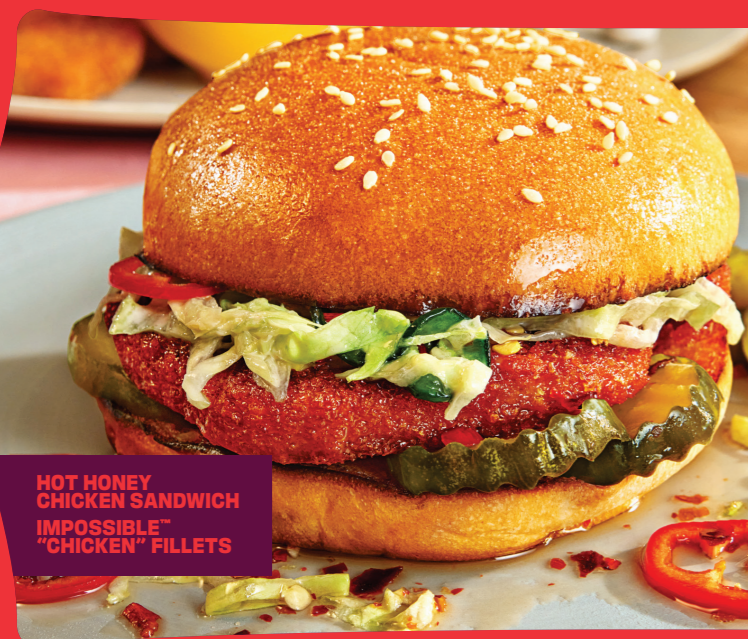
HOT HONEY CHICKEN SANDWICH IMPOSSIBLE™ "CHICKEN" FILLETS