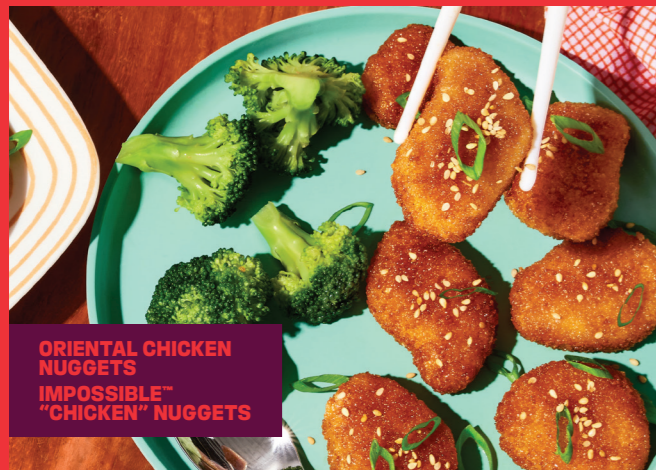
ORIENTAL CHICKEN NUGGETS IMPOSSIBLE™ "CHICKEN" NUGGETS