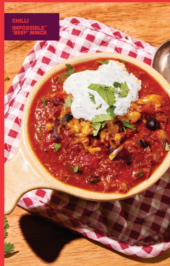
CHILLI IMPOSSIBLE™ 'BEEF' MINCE